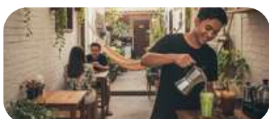
Chumchon's Secret Cafés

Hidden Coffee Gems: Wander the back lanes of Mae Phim Village to find charming, local-run cafés with great Thai coffee.