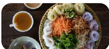
Ka Nom Jean Bann Yai Rod

Discover one of Mercure's 50 Global Bucket List: Experience authentic Rayong heritage with fresh local catch and hand-coloured noodles.