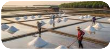
Pak Nam Prasae Salt Fields

Quiet & Scenic: See salt workers harvest crystals from the shimmering beds. Time slows down here.