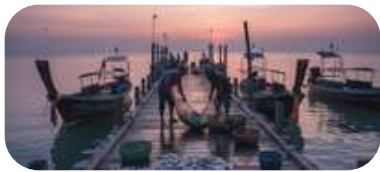
Mae Phim Fishermen's Pier

Morning Catch: No tourists, just real life. Watch chefs choose the freshest seafood right off the boats.