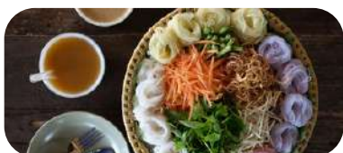
Ka Nom Jean Bann Yai Rod

Discover one of Mercure's 50 Global Bucket List: Experience authentic Rayong heritage with fresh local catch and hand-coloured noodles.