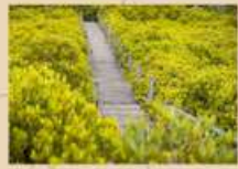
Tung Prong Thong