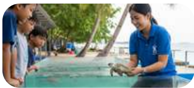
Man Nai Sea Turtle Center

Peaceful at dusk. Short walk from the beach.