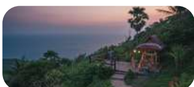
Morakot Shrine Viewpoint

~25 mins drive. Go at sunrise or late afternoon.