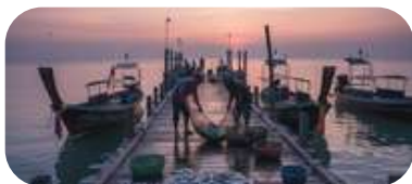
Mae Phim Fishermen's Pier

Morning Catch: No tourists, just real life. Watch chefs choose the freshest seafood right off the boats.