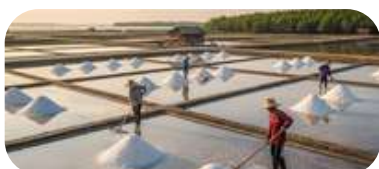
Pak Nam Prasae Salt Fields

Quiet & Scenic: See salt workers harvest crystals from the shimmering beds. Time slows down here.