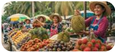
Secret Treasure Ban Tha Ruea Fruit Market

The Vibe Fruit Royalty: Skip the supermarket. Get Rayong's juiciest mango, mangosteen, and durian, plus local coconut snacks.