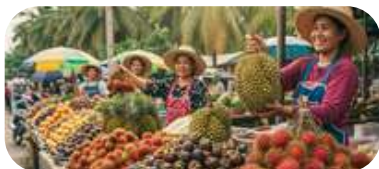
Secret Treasure Ban Tha Ruea Fruit Market

The Vibe Fruit Royalty: Skip the supermarket. Get Rayong's juiciest mango, mangosteen, and durian, plus local coconut snacks.