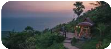
Morakot Shrine Viewpoint

~25 mins drive. Go at sunrise or late afternoon.