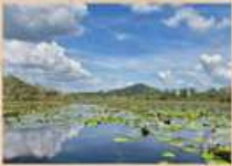
Ban Tha Ruea Fruit Markets