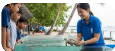
Man Nai Sea Turtle Center

Peaceful at dusk. Short walk from the beach.