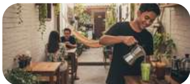
Chumchon's Secret Cafés

Hidden Coffee Gems: Wander the back lanes of Mae Phim Village to find charming, local-run cafés with great Thai coffee.