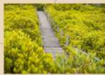
Tung Prong Thong